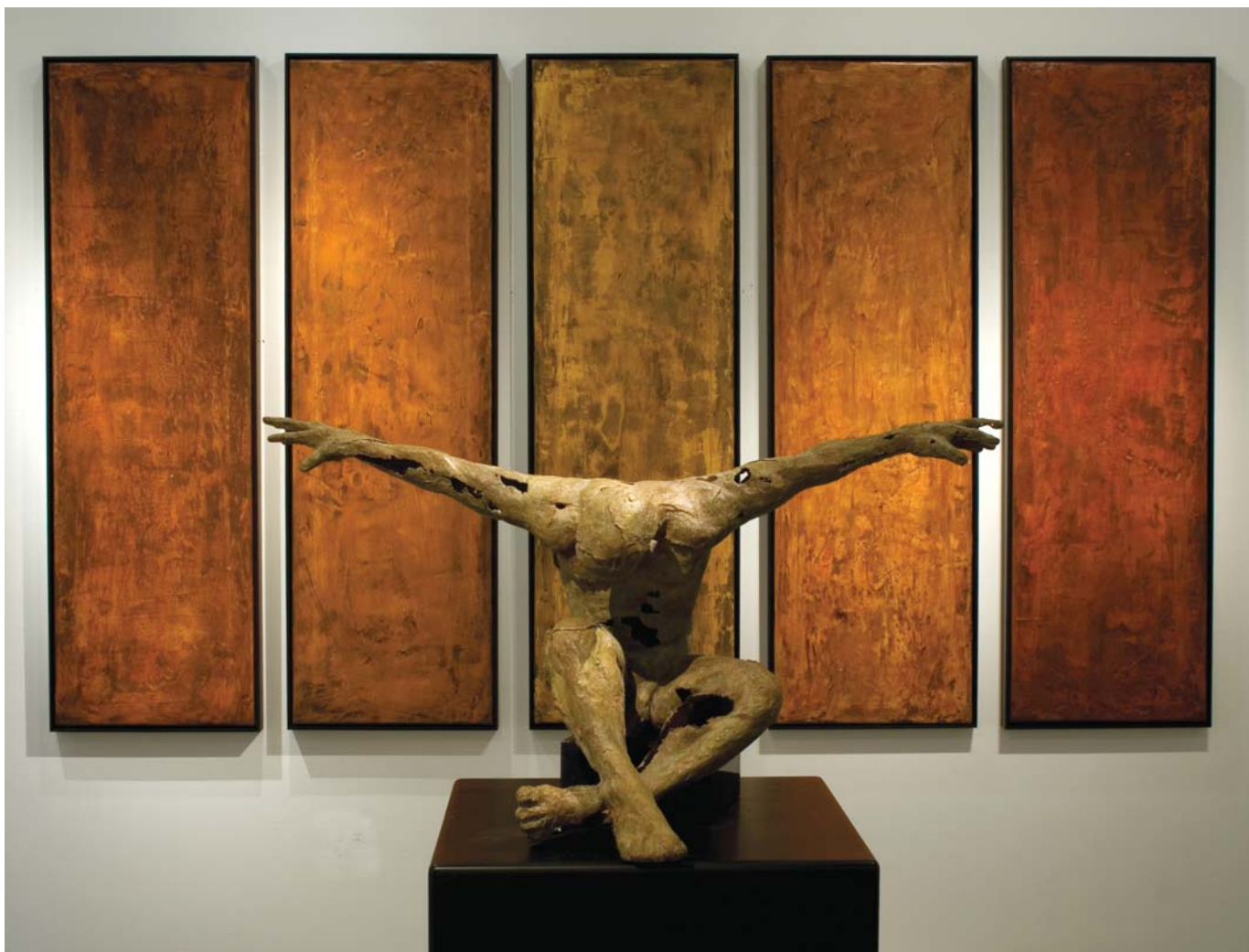
THIS FIVE-PANEL PIECE IS TITLED TEMPESTA VI.