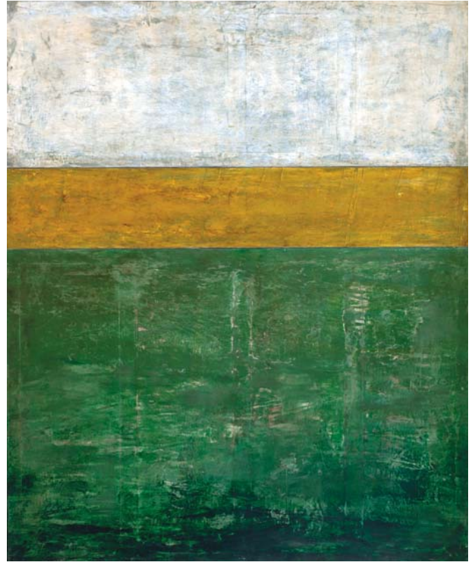
PAESAGGIO VI, MIXED MEDIA ON LINEN, 85 x 70"

The Gallery Says . . . "Combining a technical mastery of a complex array of media with a unique sensitivity to color, John Schuyler's elegant modern-day frescoes stand as memorials to themes both universal and eternal."