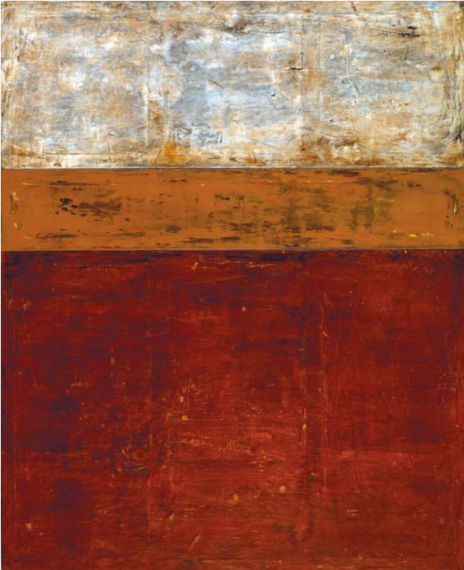
PAESAGGIO XII, MIXED MEDIA ON LINEN, 85 x 70"